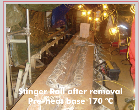
Stinger Rail after removal Pre-heat base 170 °C