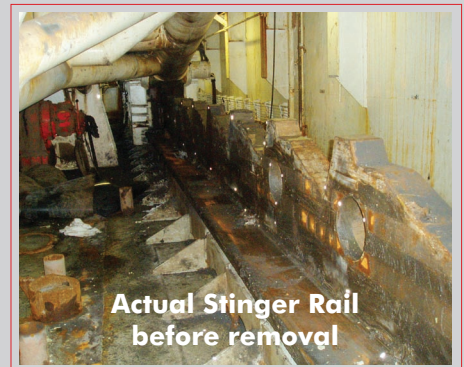
Actual Stinger Rail before removal