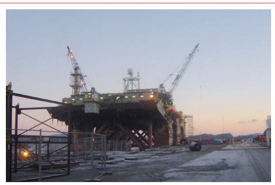
LB 2006 Refit